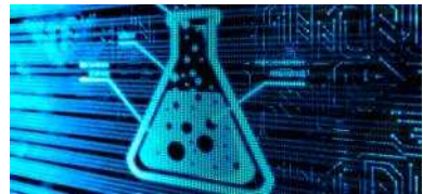
Regulatory Software Solutions